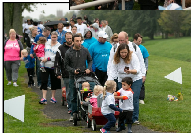
FAMILIES GATHERED TO REMEMBER THEIR BABIES GONE TOO SOON DURING THE SERVICE (ABOVE) AS WELL AS THE MEMORIAL WALK (LEFT)