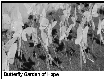
Butterfly Garden of Hope

Pre-registered families were given a personalized butterfly garden stake with their baby’s name and/or honored dates for the “Butterfly Garden of Hope” again this year. These stakes were placed in front of the