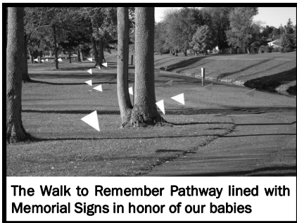
The Walk to Remember Pathway lined with Memorial Signs in honor of our babies

The 22nd Annual Walk to Remember was held on October 12, 2014 at Cheektowaga Town Park. It was a beautiful and special ceremony that paid tribute to the over 870,000 babies who die each year due to miscarriage, stillbirth, ectopic pregnancy or early infant death. Nearly 700 family members, friends, health care professionals and volunteers attended and helped create a safe and calming atmosphere in which to remember our lost babies.